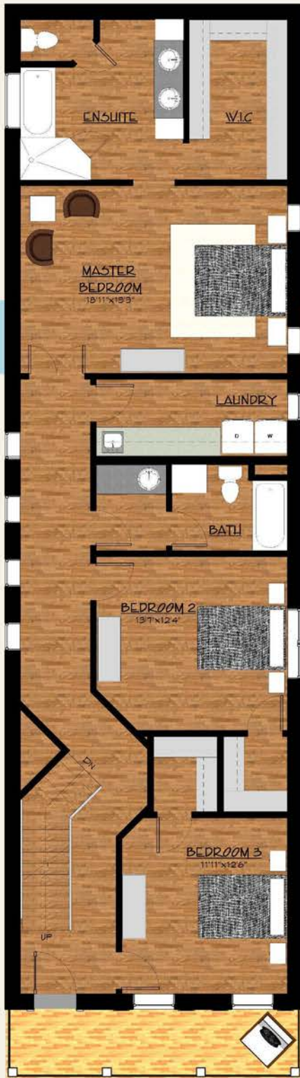
Second Floor 1491 sq.ft.