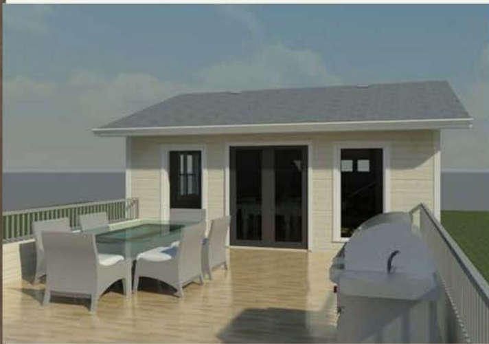
View of Rooftop Patio